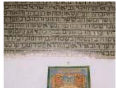
Ezekiel's Tomb Israel news photo: www.alfassa.com/

Published: 01/04/10, 1:02 PM / Last Update: 01/04/10, 1:20 PM