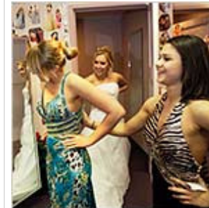
Prom Excesses, Indignities and Flashbacks