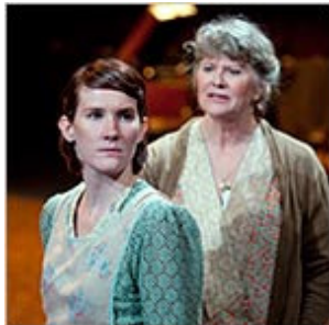
Flashes of Steel in 'The Glass Menagerie'