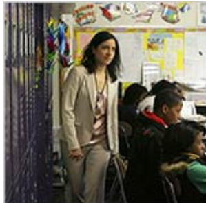
Younger Principals Raise Doubts in the Schools